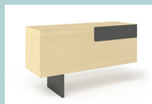
Left fixed pedestal