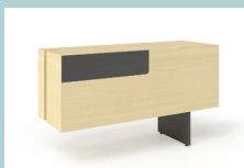
Right fixed pedestal